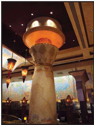
Cheesecake Factory • GRG Column

Stromberg GRG is a composite of high-strength gypsum and glass fibers, which can be factory molded into virtually any size or shape.