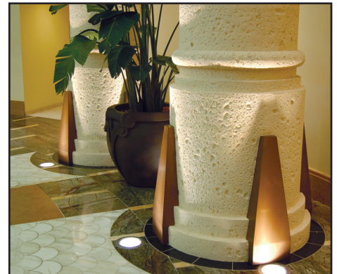
Atlantis • GRG Columns