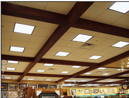
Cabela’s • GRG Ceiling Beams