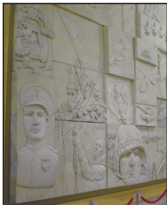
The Pentagon • GRG Custom Bas Relief

Most projects are custom. Comprehensive shop drawings show shapes and dimensions and indicate layout and fastening methods.