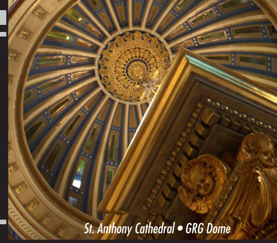
St. Anthony Cathedral • GRG Dome