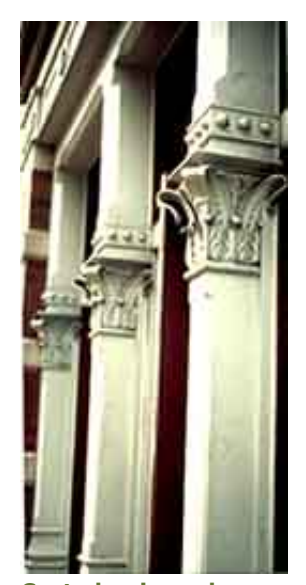
Cast aluminum has been used as a replacement material for cast iron.

Sometimes referred to as life and safety codes, building codes often require changes to historic buildings. Many cities in earthquake zones, for example, have laws requiring that overhanging masonry