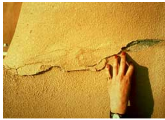
A waterproof coating is an inappropriate substitute material to apply to adobe as it seals in moisture and may result in spalling.

In order to provide an appearance that is compatible with the historic material, the new material should match the details and