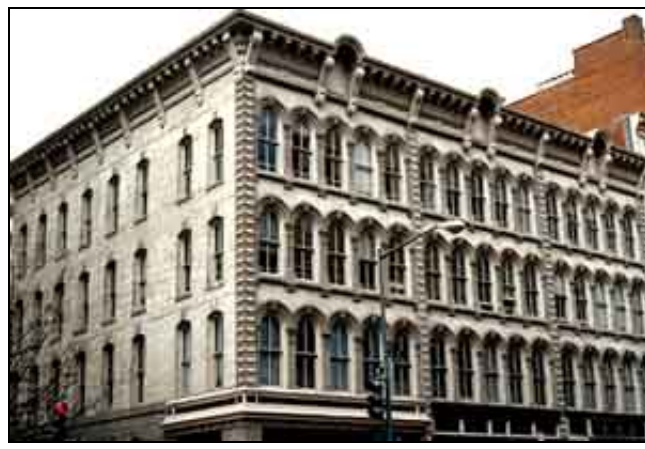
The historic cornice was successfully replaced with a fiberglass cornice.

While a substitute material may appear to be acceptable at the time of installation, both its appearance and its performance may deteriorate rapidly. Some materials are so new that industry standards are not available, thus making it difficult to specify quality control in fabrication, or to predict maintenance requirements and long term performance. Where possible, projects involving substitute materials in similar circumstances should be examined. Material specifications outlining stability of color and texture; compressive or tensile strengths if appropriate; the acceptable range of thermal coefficients, and the durability of coatings and finishes should be included in the contract documents. Without these written documents, the owner may be left with little recourse if failure occurs.