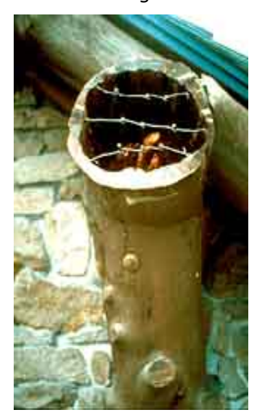
The core of a deteriorated wood outrigger was first drilled out.

Cost may or may not be a determining factor in considering the use of substitute materials. Depending on the area of the country, the amount of material needed, and the projected life of less durable substitute materials, it may be cheaper in the long run to use the original material, even though it may be harder to find.