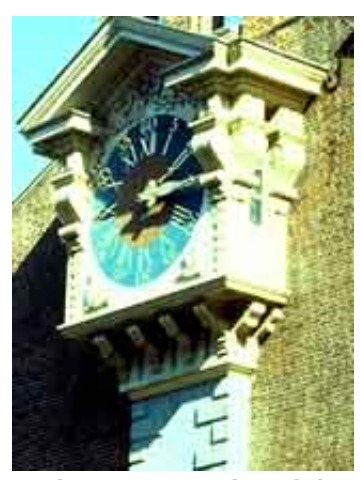
In the reconstruction of the clock tower at Independence Hall, the substitute materials used were cast stone and wood with fiberglass and polyester bronze ornamentation.

a radical change in a building's appearance and can cause extensive physical damage over time. On the more philosophical level, the wholesale use of substitute materials can raise questions concerning the integrity of historic buildings largely comprised of new materials. In both cases the integrity of the historic resource can be destroyed.