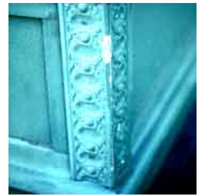
Substitute materials need to be located with care to avoid base has chipped, whereas the historic cast iron would have remained sound.

Nineteenth century technology made a variety of materials readily available that not only were able to imitate more expensive materials but were also cheaper to fabricate and easier to use. Throughout the century, imitative materials continued to evolve. For example, ornamental window hoods were originally made of wood or carved stone. In an effort to damage. The fiberglass column find a cheaper substitute for carved stone and to speed fabrication time, cast stone, an early form of concrete, or cast-iron hoods often replaced stone. Toward the end of the century, even less expensive sheet metal hoods, imitating