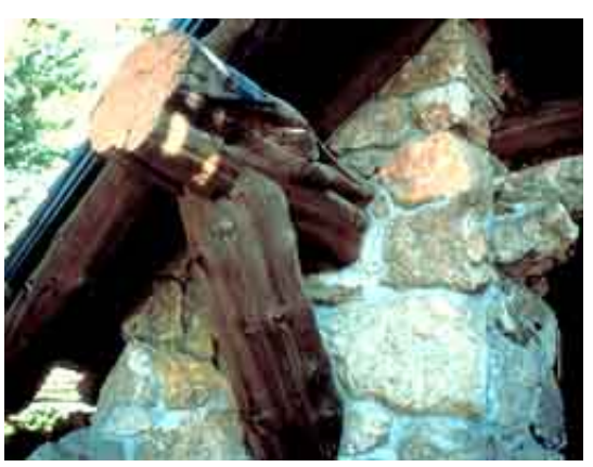
An inert material was injected into the hollow outrigger, permitting the outer wood to be retained and preserved.

Due to many early failures of substitute materials, some preservationist are looking abroad to find materials (especially stone) that match the historic materials in an effort to restore historic buildings accurately and to avoid many of the uncertainties that come with the use of substitute materials.