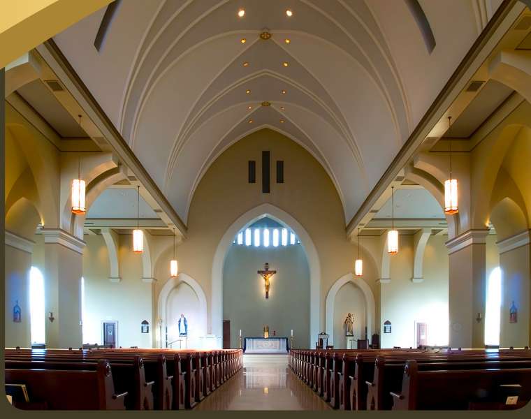
St. Mark the Evangelist Catholic Church, Birmingham, AL