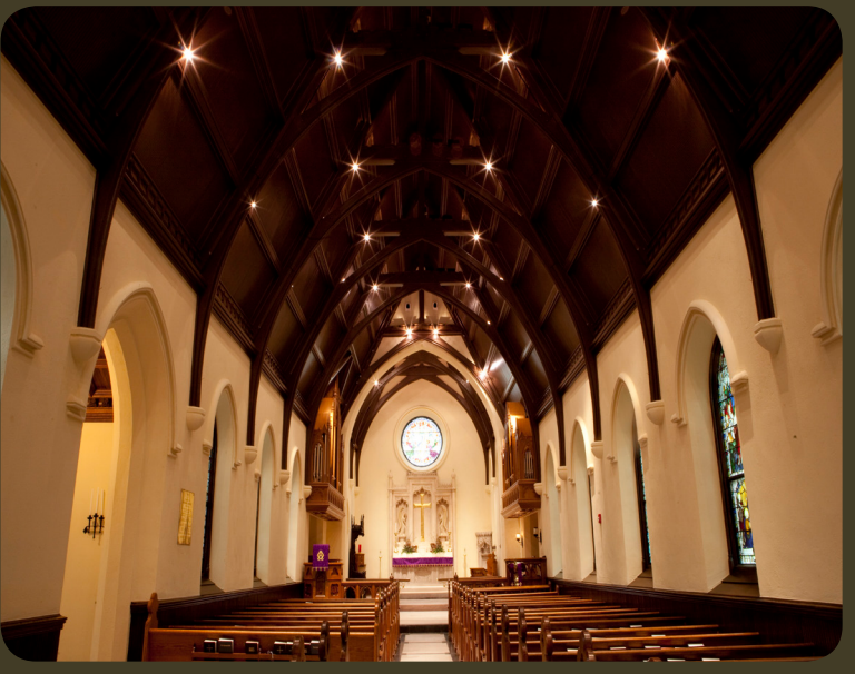
St. Bernard's Episcopal Church, Bernardsville, NJ