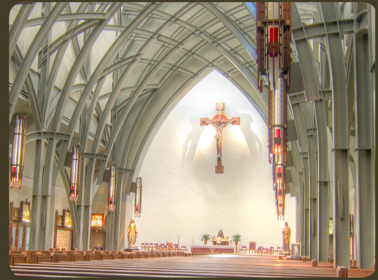
Ave Maria, Naples, FL