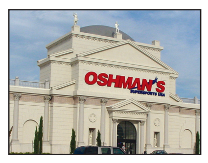
Portofino • GRC Columns, Panels, Medallions • Surrounds

Stromberg GFRC is a non-combustible mineral composite. It will not burn.