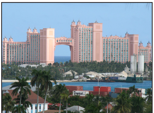
Atlantis Resort • GRC Panels