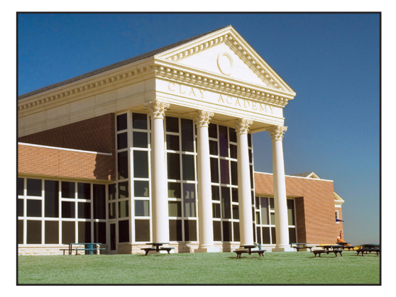
Clay Academy • GRC Columns