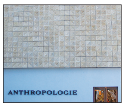
Anthropologie • GRC Rain Screen

Stromberg GFRC is a composite of high-strength concrete and glass fibers, which can be factory molded into virtually any size or shape.