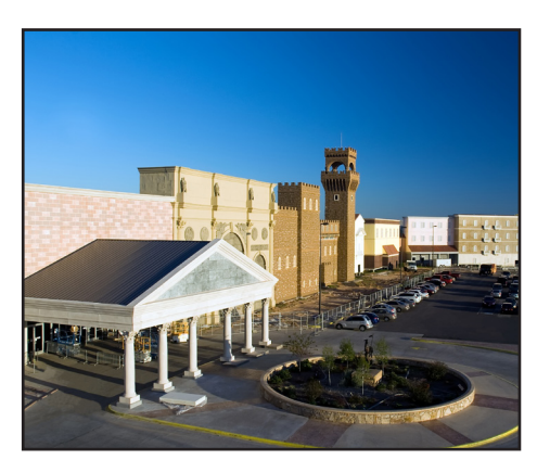
Winstar World Casino • GRC Wall Panel System