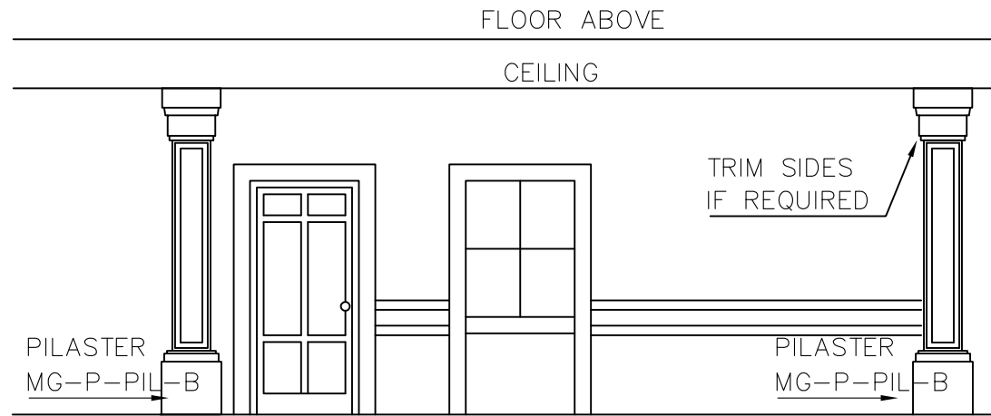
CUT TO FIT AT BOTTOM WEST ELEVATION AT MANAGERS OFFICE

ALL RIGHTS RESERVED. THIS DRAWING IS PROPERTY OF STROMBERG ARCHITECTURAL PRODUCTS INC. AND MAY BE USED ONLY WHEN UTILIZING STROMBERG ARCHITECTURAL PRODUCTS. STROMBERG ARCHITECTURAL PRODUCTS INC. GENERAL TERMS AND CONDITIONS APPLY AND ARE INCORPORATE HERE IN BY REFERENCE. THIS DETAIL MAY NOT APPLY TO ALL CONDITIONS AND CONSTRUCTION SITUATIONS.